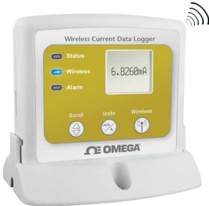
OM-CP-RFCURRENT2000A shown smaller than actual size.