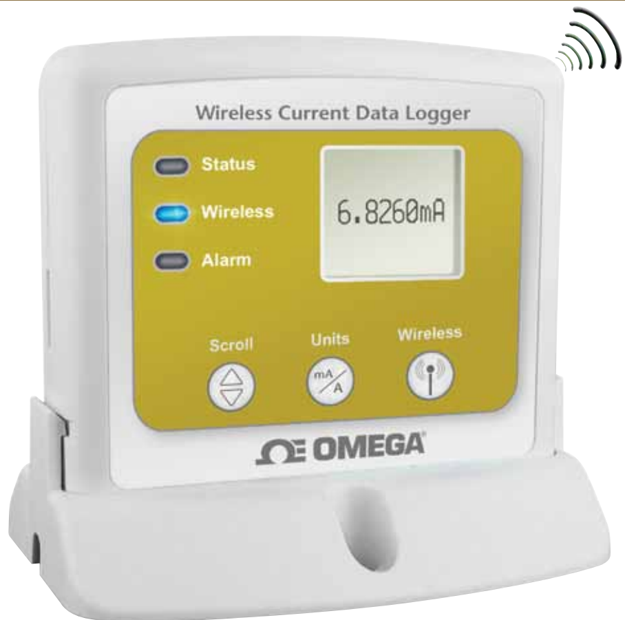
OM-CP-RFCURRENT2000A shown smaller than actual size.

The OM-CP-RFCURRENT2000A transmits up to 152 m (500') line of sight to the OM-CP-RFC1000-EXT transceiver. Multiple OM-CP-RFC1000-EXT's can be used as repeaters and transmit up to 305 m (1000') line of sight to other OM-CP-RFC1000-EXT's. This allows the data to be sent over a greater distance.