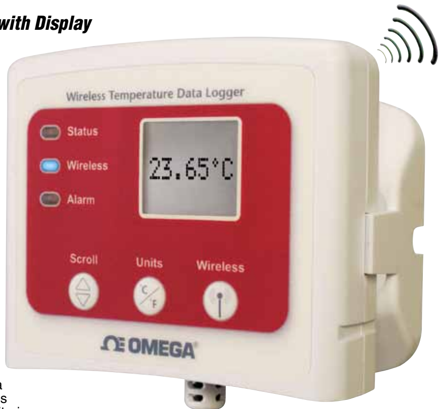
OM-CP-RFTEMP2000A with mounting bracket shown actual size.