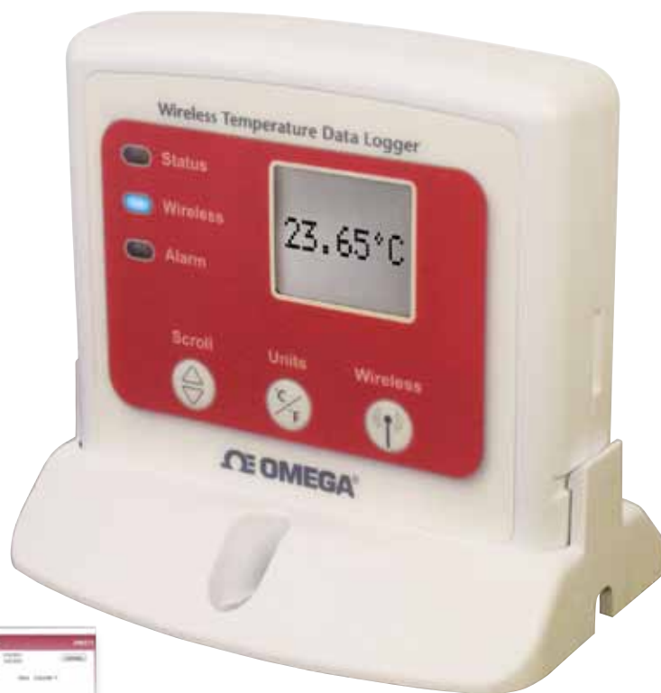
OM-CP-RFTEMP2000A shown smaller than actual size.

Alarm: Programmable high and low limits; alarm is activated when temperature reaches or exceeds set limits