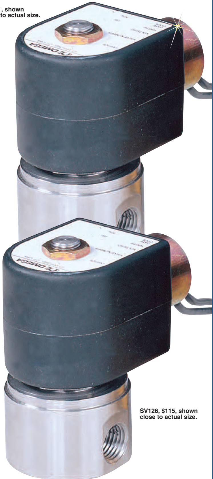
SV126, $115, shown close to actual size.