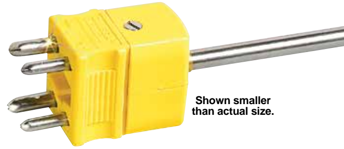
Shown smaller than actual size.