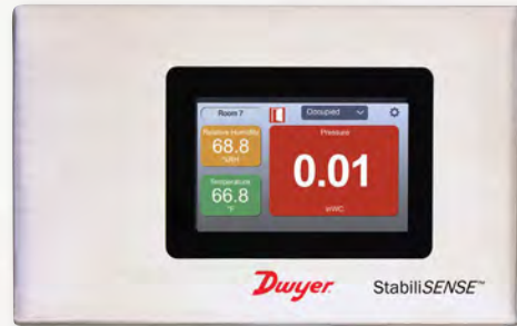
RSMC with stainless steel bezel option