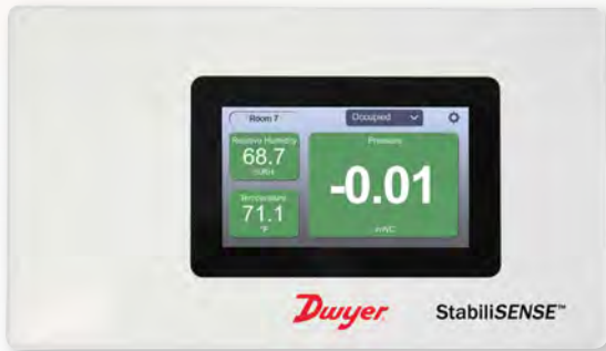
RSMC with standard plastic bezel