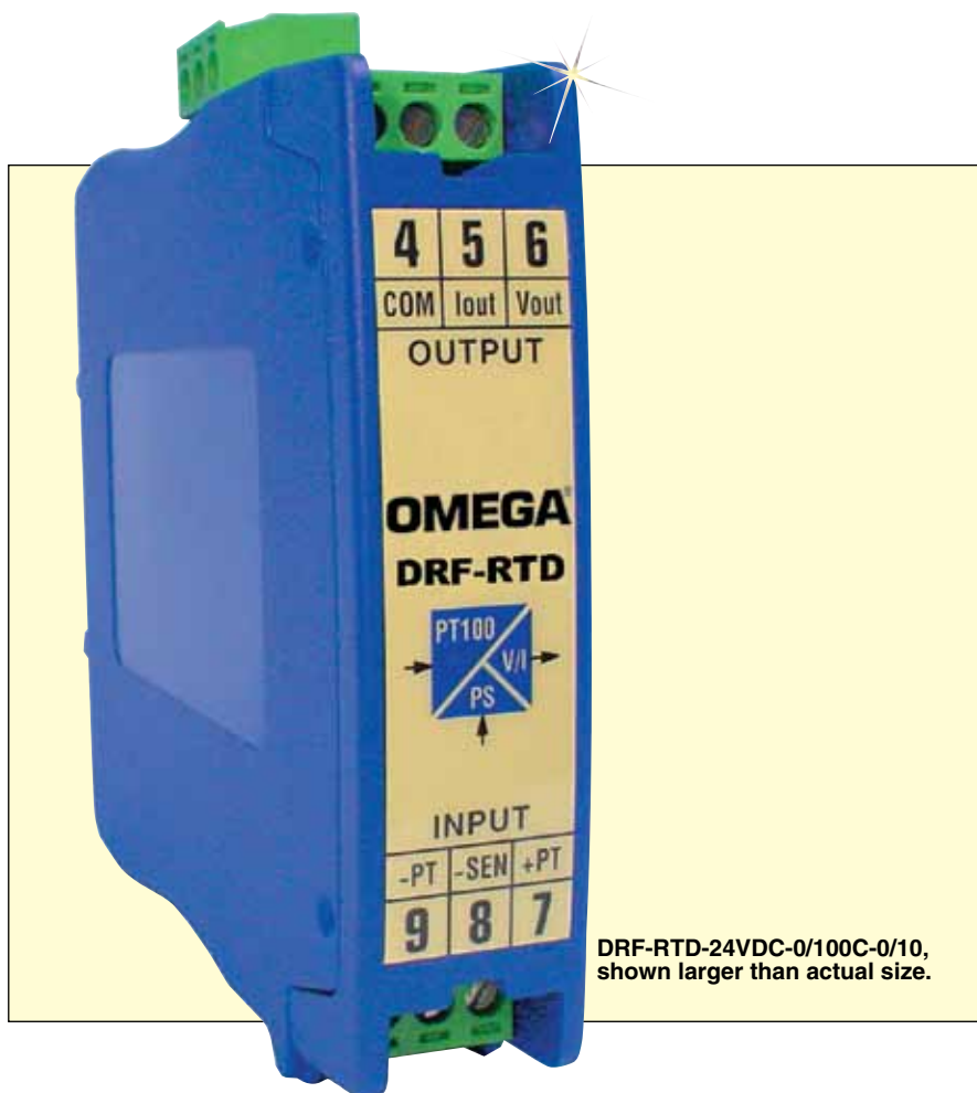
DRF-RTD-24VDC-0/100C-0/10, shown larger than actual size.

Input Impedance: Measured with a "Wheatstone" bridge. Bridge to positive through a 100 \Omega resistance, Bridge to negative through a 10 K \Omega resistance