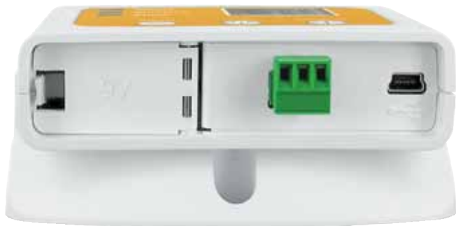
Bottom of OM-CP-RFVOLT2000A-160MV shown smaller than actual size.

Audible Alarm Functionality: 1 beep per second for reading alarm above/below threshold