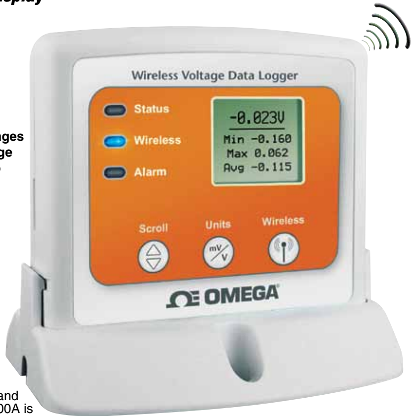
OM-CP-RFVOLT2000A shown smaller than actual size.

The OM-CP-RFVOLT2000A can be used as a standalone data logger, or used with the OM-CP-RFC1000-EXT wireless transceiver, to transmit data back to a central PC. The OM-CP-RFVOLT2000A transmits up to 152 m (500') line of sight to the OM-CP-RFC1000-EXT transceiver. Multiple OM-CP-RFC1000-EXT's can be used as repeaters and transmit up to 305 m (1000') line of sight to other OM-CP-RFC1000-EXT's. This allows the data to be sent over a greater distance.