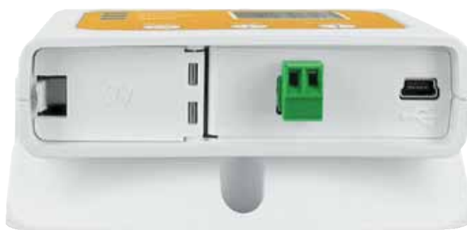
Bottom of OM-CP-RFVOLT2000A-2.5V, OM-CP-RFVOLT2000A-15V and OM-CP-RFVOLT2000A-30V shown smaller than actual size.