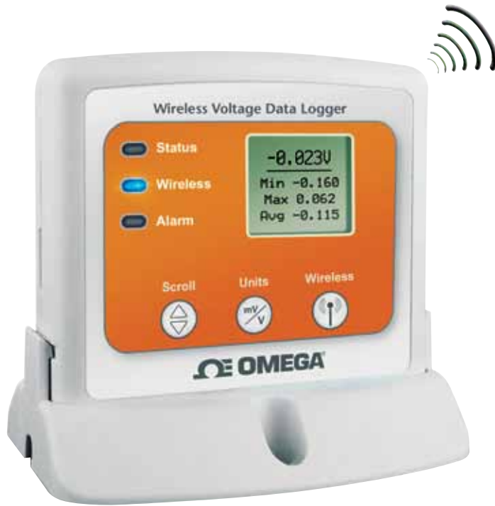
OM-CP-RFVOLT2000A shown smaller than actual size.

Note: Because of transmission frequency regulations, OM-CP-RFVOLT2000A wireless data loggers are only approved for use in the following countries: Australia, Austria, Belgium, Bulgaria, Canada, Chile, China, Columbia, Croatia, Cyprus, Czech Republic, Denmark, Ecuador, Estonia, Finland, France, Germany, Greece, Honduras, Hungary, Iceland, Ireland, Israel, Japan, Latvia, Liechtenstein, Lithuania, Luxembourg, Malaysia, Malta, Mexico, New Zealand, Norway, Peru, Poland, Portugal, Romania, Saudi Arabia, Singapore, Slovakia, Slovenia, South Africa, South Korea, Spain, Sweden, Switzerland, Thailand, The Netherlands, Turkey, United Kingdom, United States, Venezuela, Vietnam.