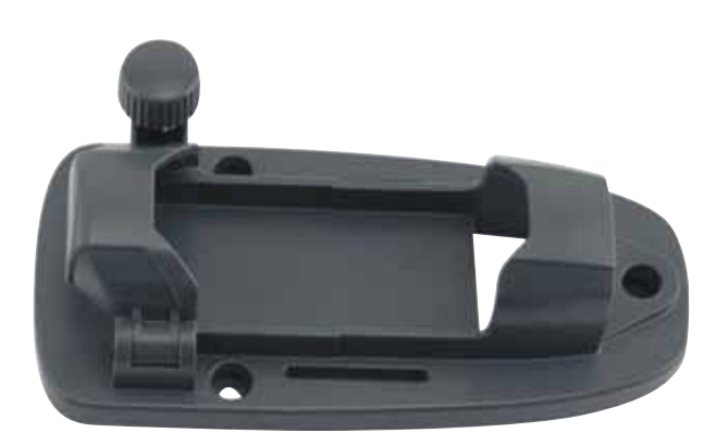
OM-VIB-101 mounting pedestal (included).