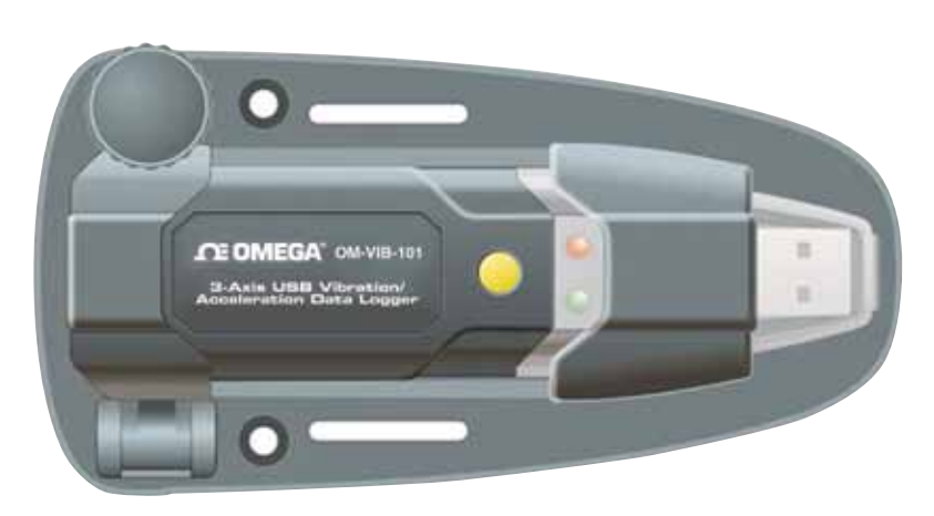
OM-VIB-101 and mounting pedestal (included).