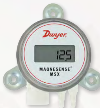
MSX with optional LCD