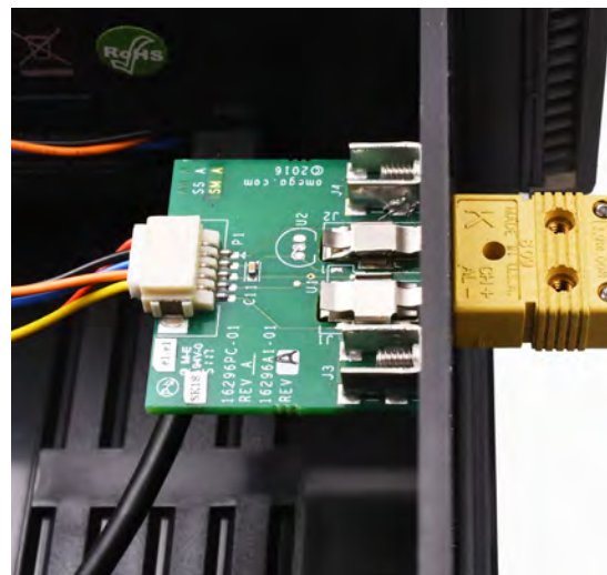
Circuit board and male connector for reference only. Not included with connectors.