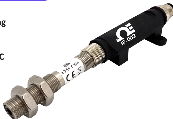
Probe not included