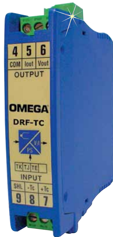
DRF-TCJ-115VAC-0/400C-4/20, shown larger than actual size

The DRF-TC are ideally suited for industrial applications. All models mount on a standard 35 mm DIN rail and provide galvanic isolation between input, output and power up to 3500 Veff (model specific). To insure maximum measurement accuracy the units feature cold junction compensation, 0.2% linearity and less than 0.1°C/1°C thermal drift due to compensation. Module response time is 250 ms or less.